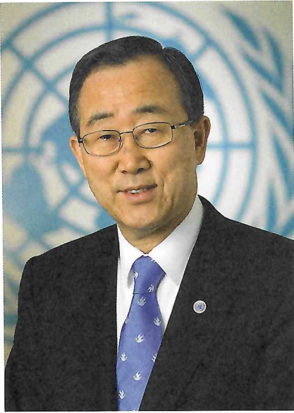
H.E. Ban Ki-moon, UN Secretary-General

“ A growing number of businesses in all regions recognize the importance of reflecting environmental, social and economic considerations in their operations and strategies.